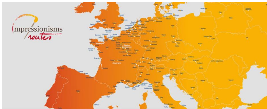
Fig. 1. An example of a non-interactive map from the 'Impressionisms Routes'.

Usually, websites of archipelago routes do not present an interactive map of itineraries, but they rather offer a map where the different hotspots/attractions are indicated with descriptions, pictures, and sometimes even videos. This reflects the typology of the route, which does not follow precise and linear itineraries but is created by the visitor who decides what to visit. All these routes share an artistic or historical theme; some examples are: 'Réseau Art Nouveau Network', 'Impressionisms Routes', 'In the Footsteps of Robert Stevenson', 'Le Corbusier Destinations: Architectural Promenades'.