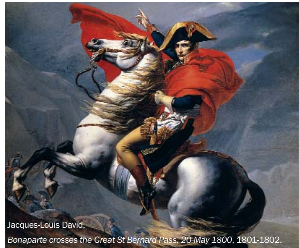
Jacques-Louis David, Bonaparte crosses the Great St Bernard Pass, 20 May 1800, 1801-1802.