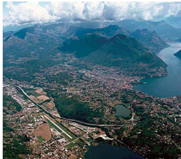
A bird's eye view of Lugano and its neighbouring region

New Lugano (Nuova Lugano in Italian) is the name given to the outcome of the merger process in which the City of Lugano has joined up with the communes dotted around its periphery or suburban area. The name calls attention to the combined notion of 'aggregation' and 'urban agglomeration'. Indeed, the phenomenon of council mergers brings to light novel needs and almost a sense of inevitability, for example in the field of transport and telecommunication, to the effect that today's urban structures have become far more complex and articulated. The new circumstances in which an industrial economy is being replaced by an increasingly service-intensive economy, has profoundly transformed the productive and economic fabric of the city. The progressive changes affecting its infrastructure denote a more isotropic territory and a different new degree of complexity, which is to be absorbed into the planning and design of the city, by means of new analytic and interpretative tools. Professor Josep Acebillo, Director of the Academy of Architecture at Mendrisio, in charge of this research programme, describes the situation as follows: "Today, town planning is no longer what it used to be twenty or thirty years ago. The difference is relevant: the new economy has blown in like a wind of change over the territory, sweeping away the industrial economy; this wind of change has stirred up the need to see the territory as something far more