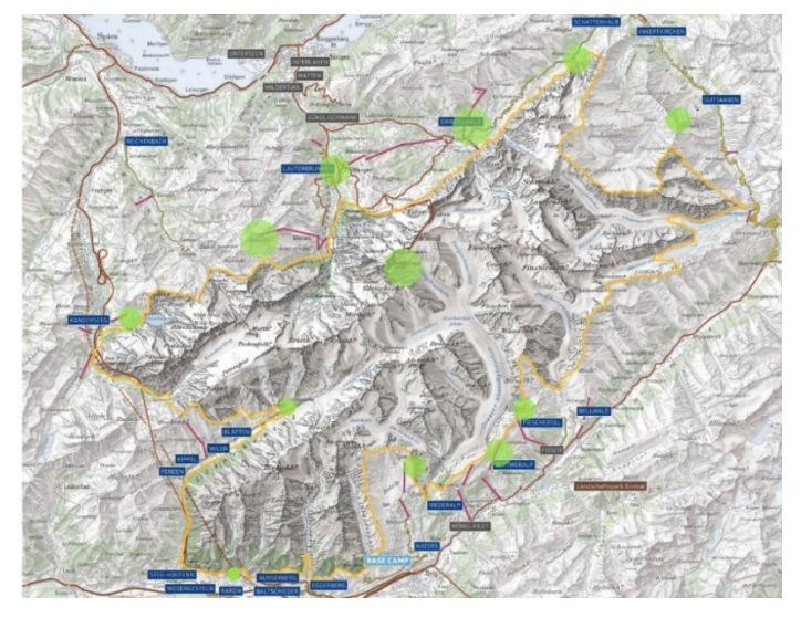
Fig. 2. Destinations of the SAJA World Heritage Region including places and their presence on TripAdvisor