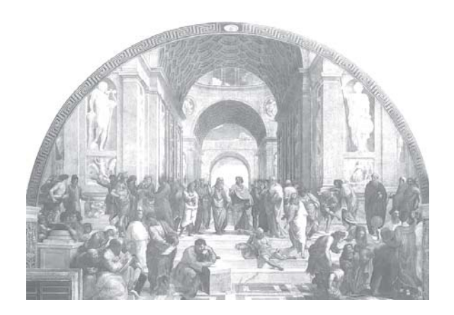
Figure 1: The School of Athens, Raffaello Sanzio, 15091

When Raffaello Sanzio painted his well-know fresco The School of Athens (Figure 1) in the Stanza della Segnatura (Palazzi pontifici, Vatican), he was certainly unaware that his masterpiece might one day quasi-perfectly rep-